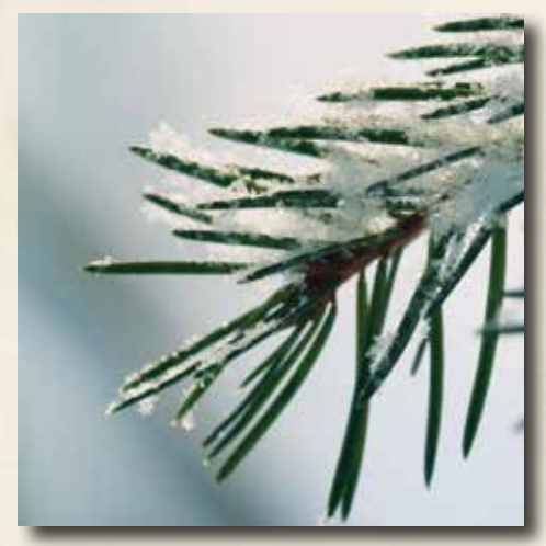
What is the world record for the most snowfall in a 24-hour period?

Scientists at the University of Texas at Dallas are working to develop fabrics using carbon nanotubes. The super small, hollow tubes are 10,000 times thinner than a human hair. When twisted into coils and stretched, they can produce a minuscule electrical current. One recent test of a tight shirt using the special yarn produced 16 millivolts every time the person wearing it inhaled—not enough to charge a smartphone, but enough, perhaps, to send health information to another location.