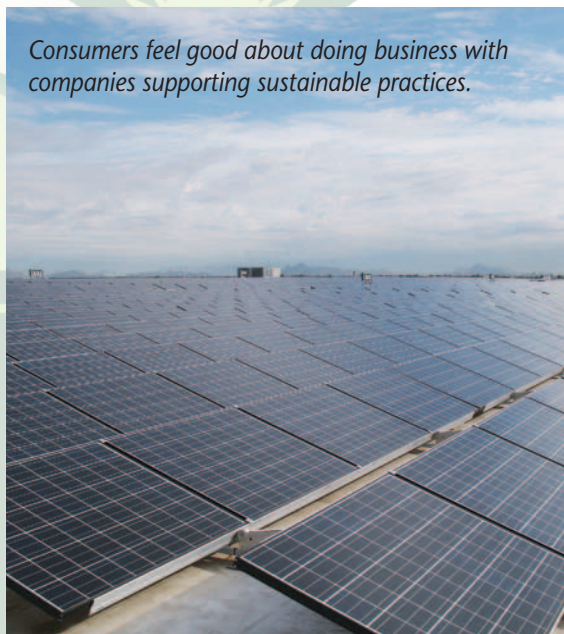
Consumers feel good about doing business with companies supporting sustainable practices.

Take a look at http://gogreen-hutchinson.com/Commercial.aspx for more information.